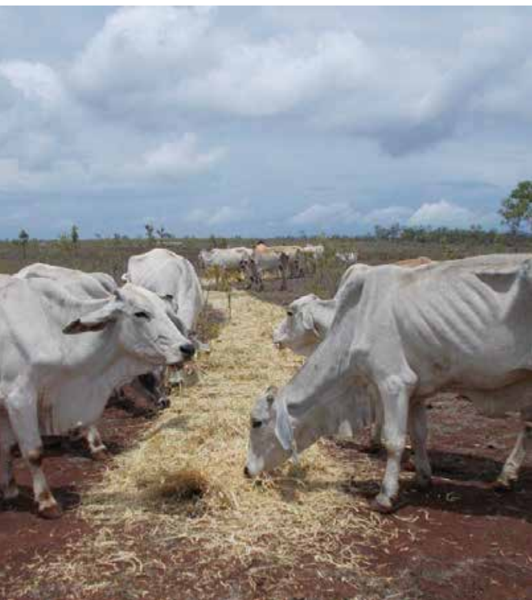
Cattle Feeding, Cook Shire Region

www.daf.qld.gov.au/environment/drought/managing-drought/drought-strategies