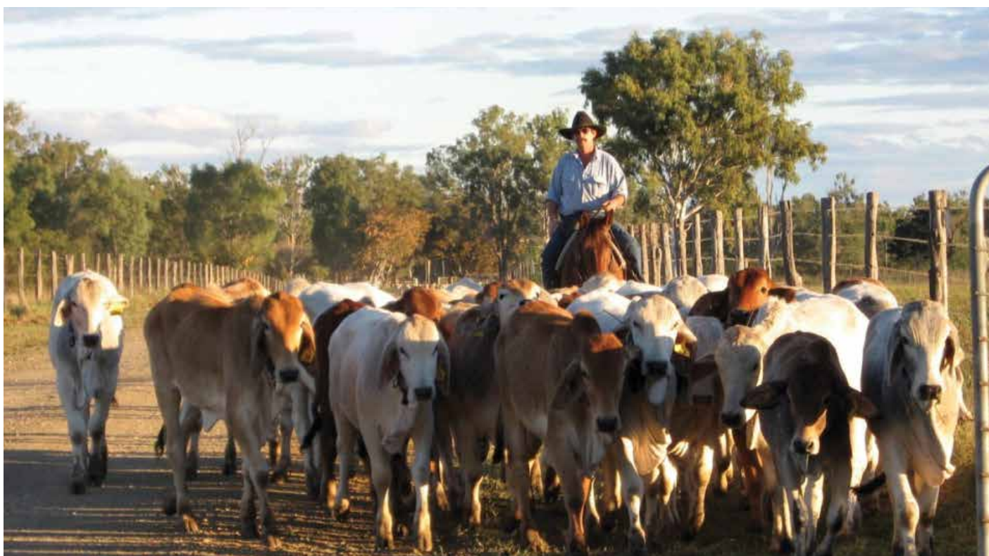
Herding Cattle, Drought Affected Property