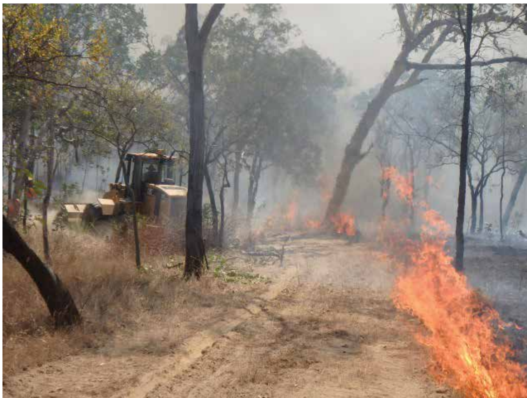
Fire Break Preparation